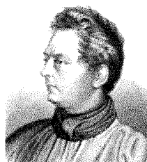
Portrait of Clemens Brentano