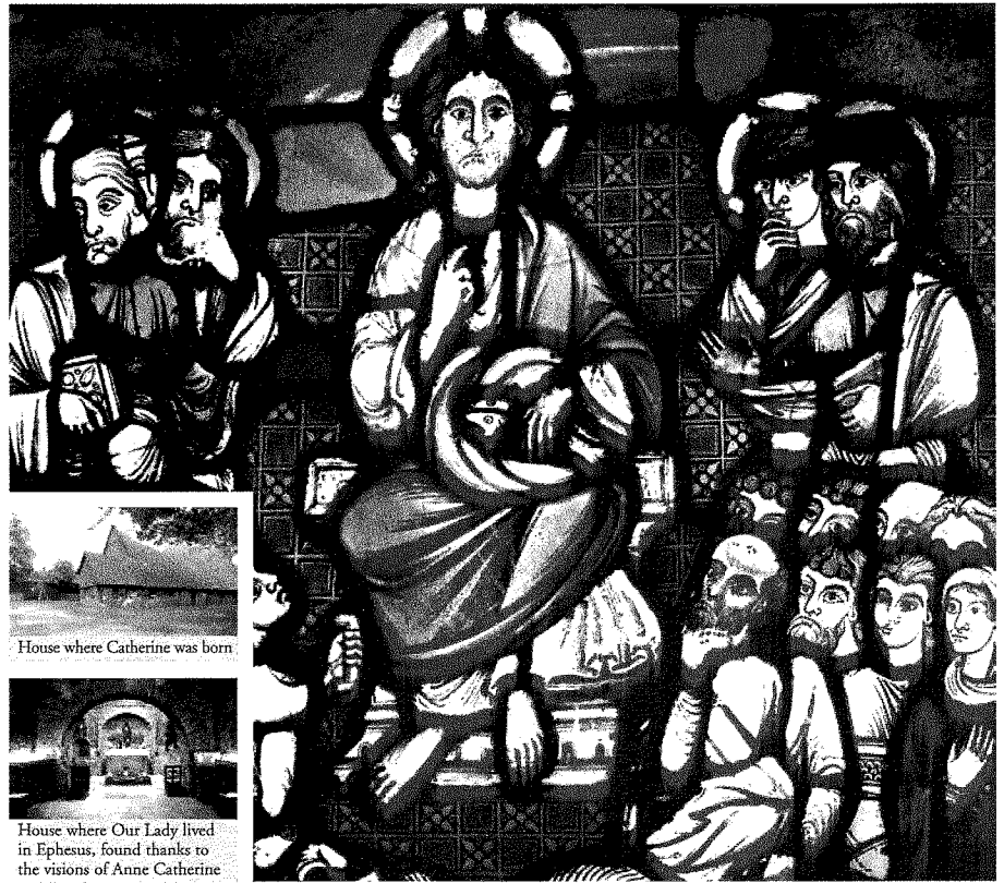
House where Catherine was born

Anne Catherine Emmerich was forced to abandon the monastery in which she lived because it was being appropriated by the government. In that period, her health declined and the mystical experiences increased: she received the stigmata and had numerous visions. One of these allowed the finding of the house of Our Lady in Ephesus. In fact, according to antique traditions, it seems that Mary settled, together with John the Apostle, in this city. The miraculous aspect of the life of Anne Catherine is that for years she fed only on the Eucharist.