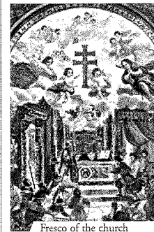
Fresco of the church