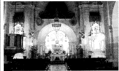
Interior of the Church of Santa Cruz