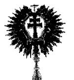
Banner depicting the Cross of Caravaca