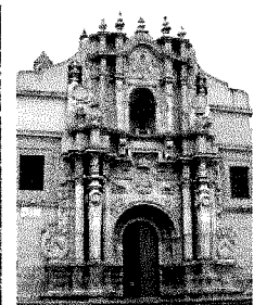
Church of Santa Cruz built where the miracle took place