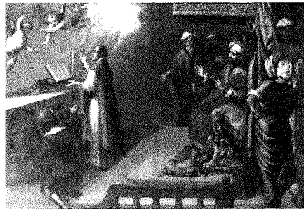
Ancient painting in the interior of the Church depicting the miracle