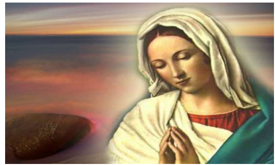
St. Mary's ~ Chokio