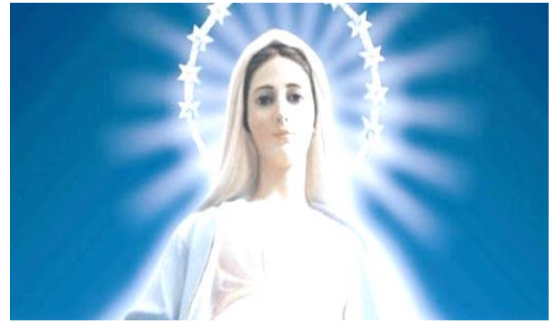
Ave Maria ~ Wheaton