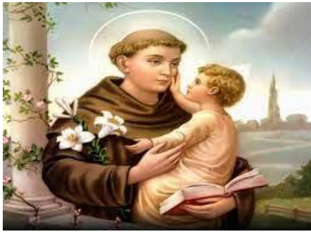
St. Anthony ~ Browns Valley