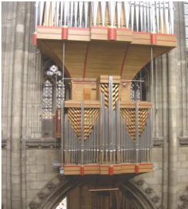
The “swallow’s nest” organ Was built into the gallery in 1998 to celebrate the cathedral’s 750 years.